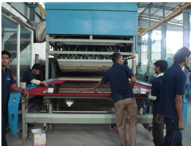
Glass Factory Pigdamber, Indore