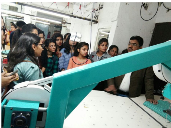
Industry Visit Amod Garments, Indore